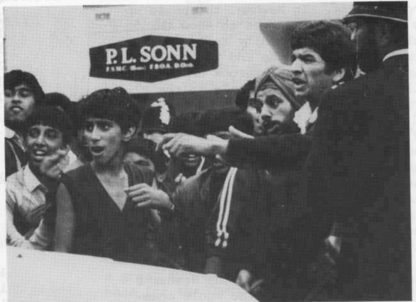
The anger and anguish.