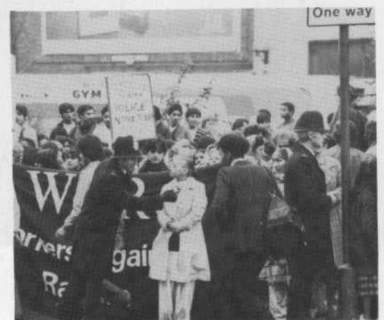
Newham 8 school strike, Nov. 1982.