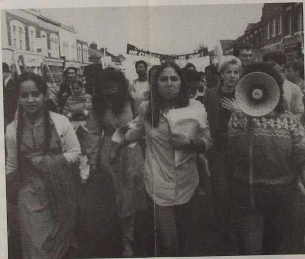
Asian Women march in protest against Racism and Racist attacks.

Thursday, 10th November, at Snaresbrook Crown Courts. In Newham, the build up to the trials only goes to show the ability of the community to organise itself. This buildup and the continuous pickets outside Snaresbrook Crown Court will play an important role in the trials. This was shown in the trials of the Bradford 12. One of the Bradford 12 defendants then said, "The support we received from the community, and the fact that people all the time packed the courts both inside and outside, played a very important part in determining the direction of the trials - the victory for the Bradford 12 was a victory for the whole community".