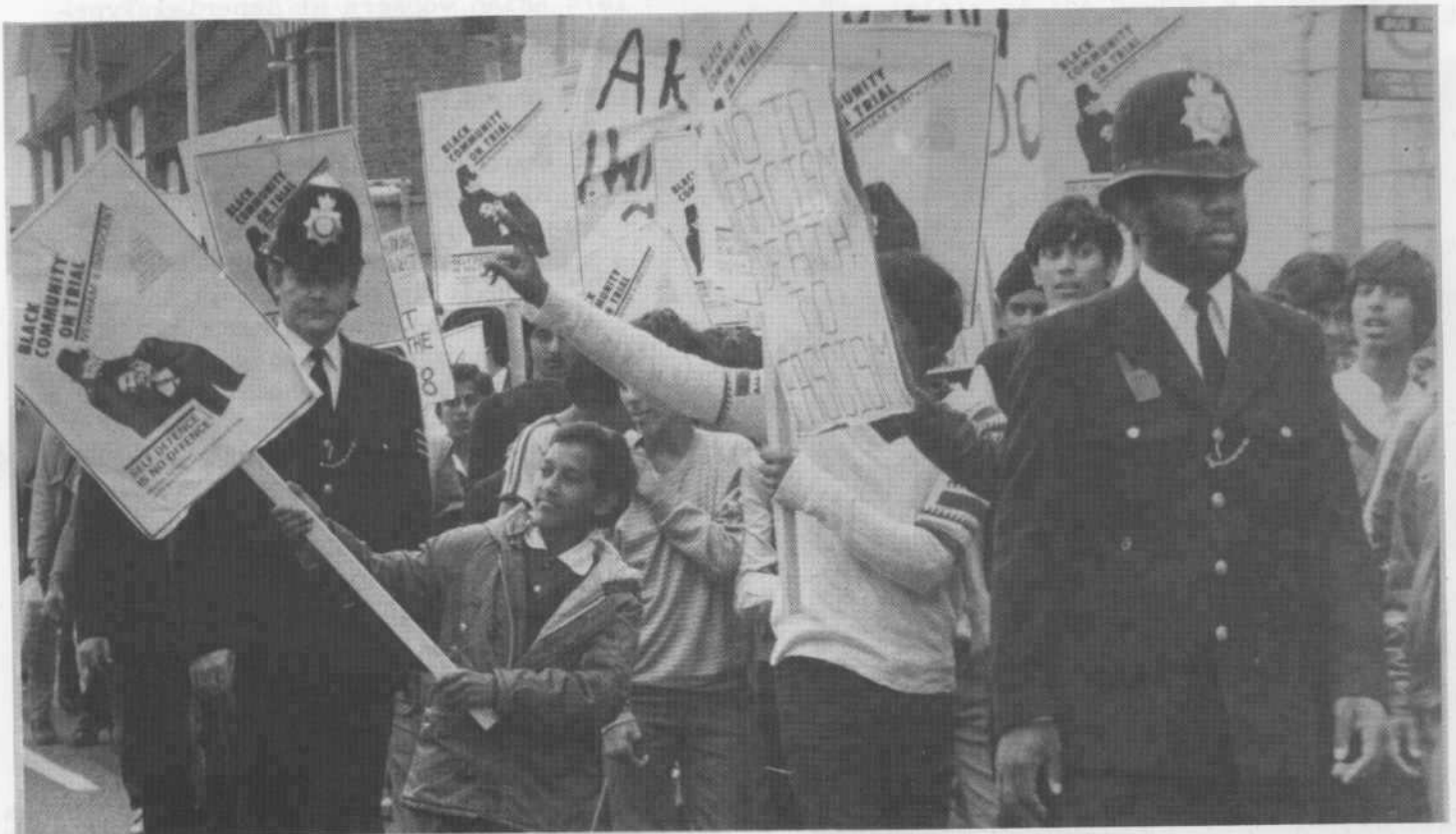
At what price community policing?