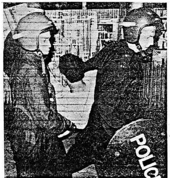
ASIAN AND AFRO-CARIBBEAN YOUTH -- EQUAL TARGETS FOR THE POLICE