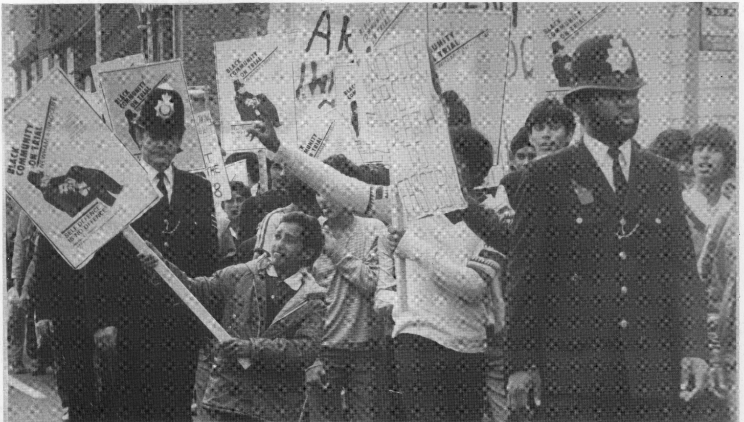
At what price community policing?