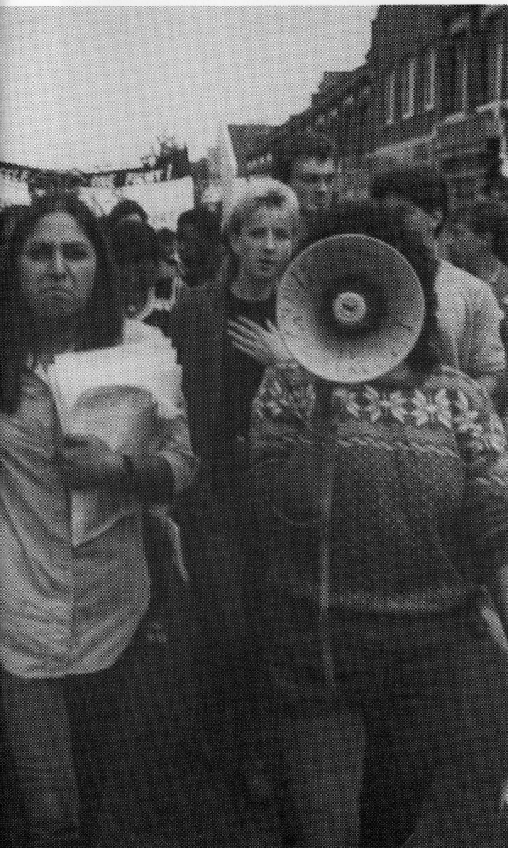
and Racist attacks.

Similarly, a victory for the Newham 8 will be a victory for the whole community. It is for that very reason that we have to be at Snaresbrook Crown Court at the trials of the Newham 8.