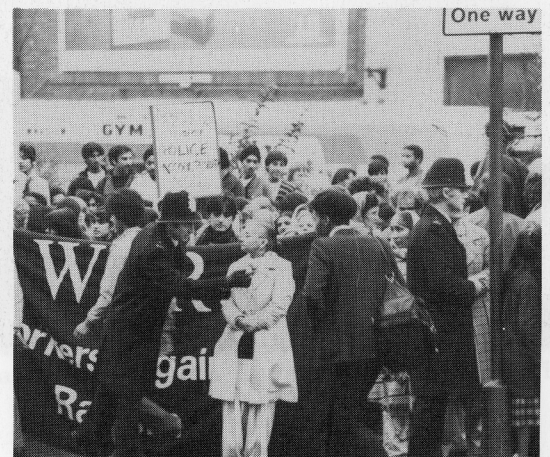
Newham 8 school strike, Nov. 1982.