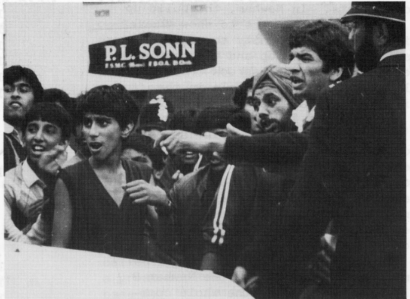
The anger and anguish.