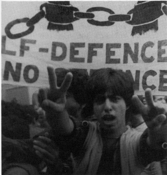
Self Defence is No Offence!